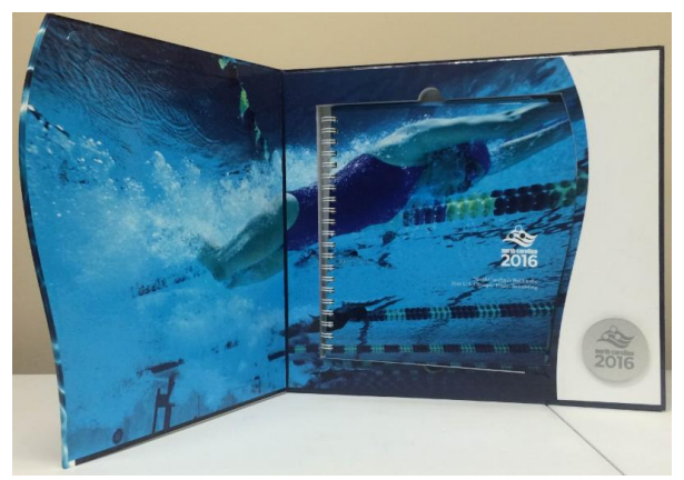
2016 Olympic Swim Trials Bid

Following up on the Swimming Olympic Trials bid, SPI's production of the bid for the 2015-2018 Atlantic Coast Conference Baseball Championships on behalf of the City of Durham and the Triangle region, also won a regional